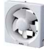
APB15-3-A. APB20-4-A APB25-5-A. APB30-6-A