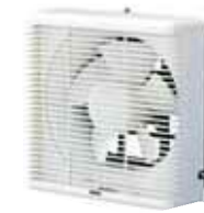
APB15-3-B. APB20-4-B APB25-5-B. APB30-6-B