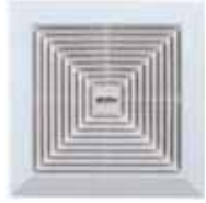
APT20-3-2 APT25-4-1 APT30-5-1

The patented motor provides longer life cycle with low power consumption.